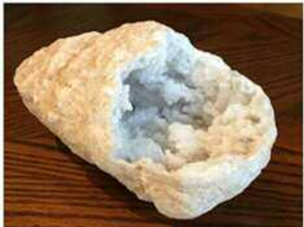
White Quartz Geode. 3 1/2'' across the mouth. 3 3/4'' tall. 6 3/4'' long.