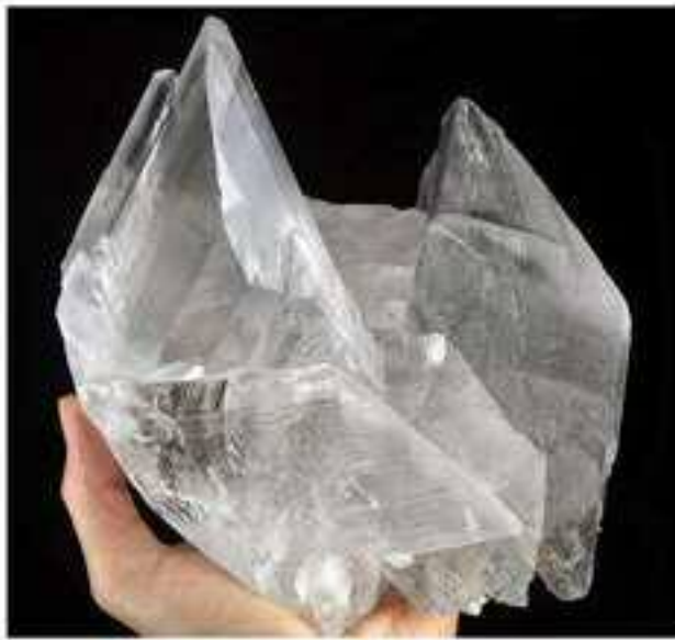
Water-clear crystal floater from the Naica Mine. weight 2.6 kg