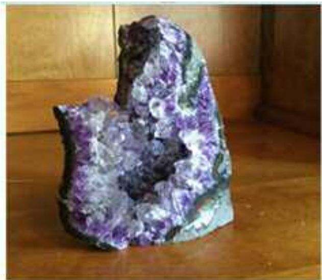
Amethyst Crystal Druse. 4''w x 5''h x 3 1/4'' thick.

We as a club appreciate each other and all and every donation. Donations are what allows our non profit club to thrive and allows us as a club to donate to the community including the ability to do all the exciting things, we do do every month.