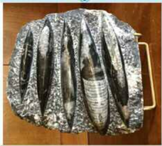
Orthoceras (Squid) 500 - 190 million years old. 7 1/2'' H x 6 1/4'' W.5