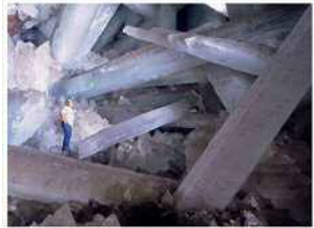
A geologist explores the caves of giant crystals inside the Naica

Penelope Boston (New Mexico Institute of Mining and Technology), speleologist specialist of extremophile organisms realized sterile sampling of gypsum drill cores by making small boreholes inside large crystals under aseptic conditions. The aim was to detect the possible presence of ancient bacteria encapsulated inside fluid and solid inclusions present in the calcium sulfate matrix from its formation.