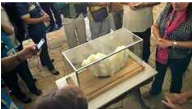
Viewers see the clam-grown natural pearl for the first time

The pearl, which has not yet been named, beats the current “world’s largest” pearl known to exist; the Pearl of Allah (sometimes called the Pearl of Lao tze). which is valued at $36 million and weigh less than 15 pounds.