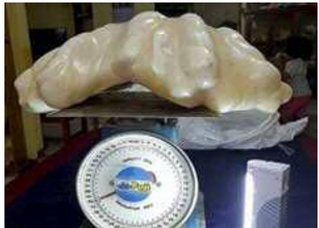
The nearly 75-pound pearl was found 10 years ago inside a clam. Approximately 2 feet long by 1 foot wide, it is valued at $100 Million.

This pearl was recently shown to the public in the Philippines for the first time.