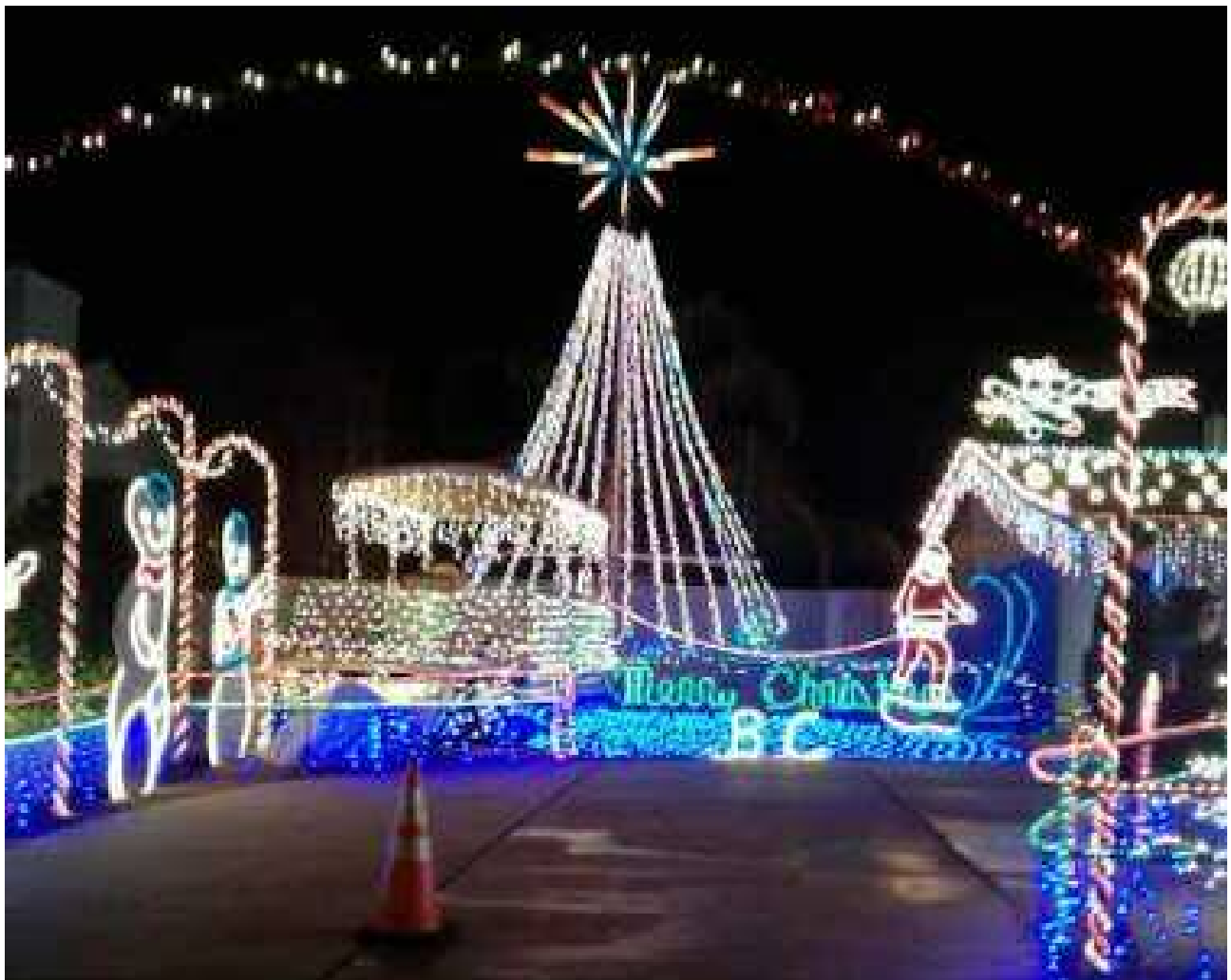
Christmas in Nevada