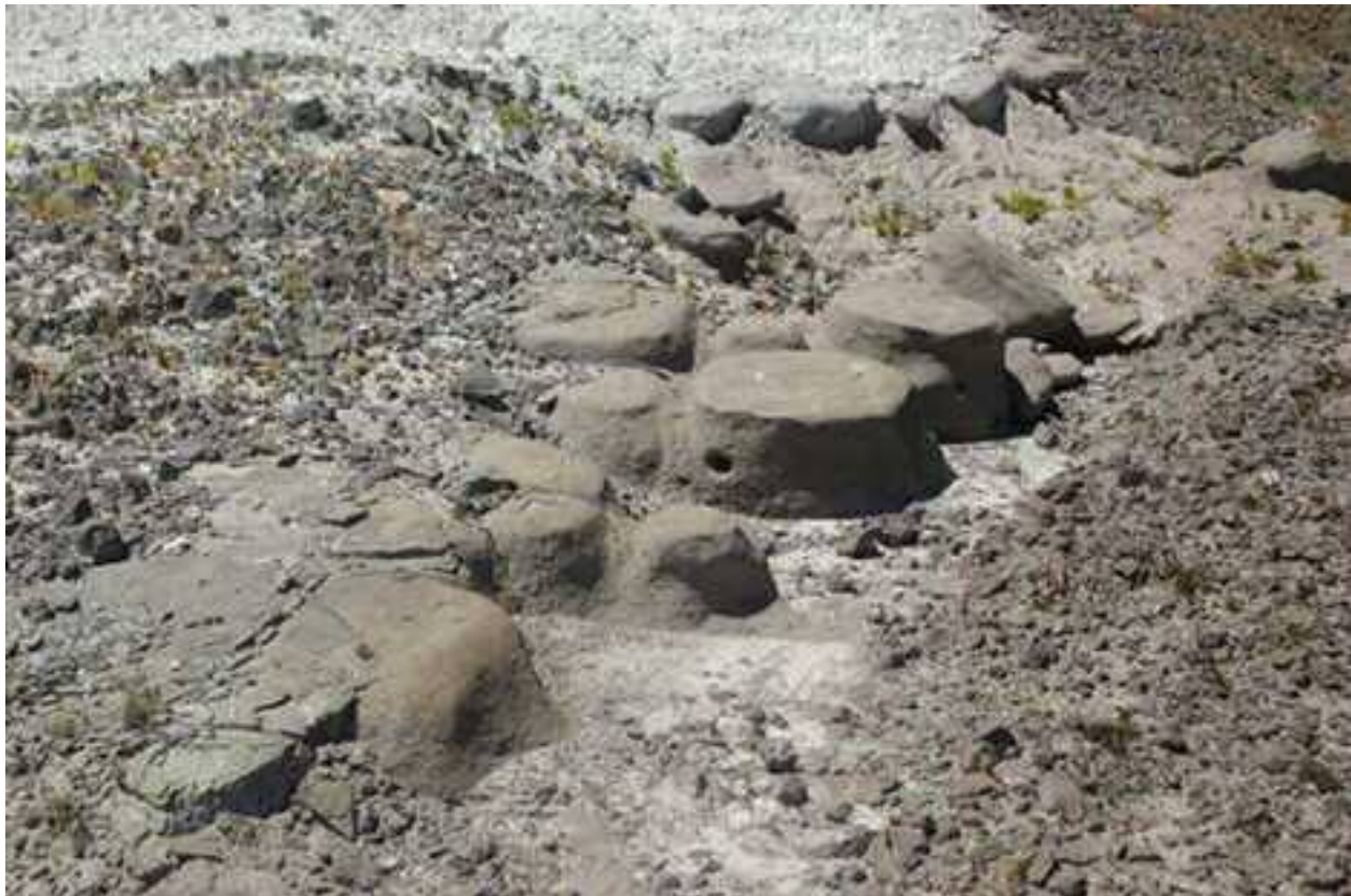
Afton Canyon/Cady Mountains April 29, 2005