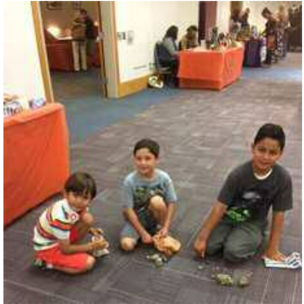
Kids evaluating their rocks after purchasing grab bags.