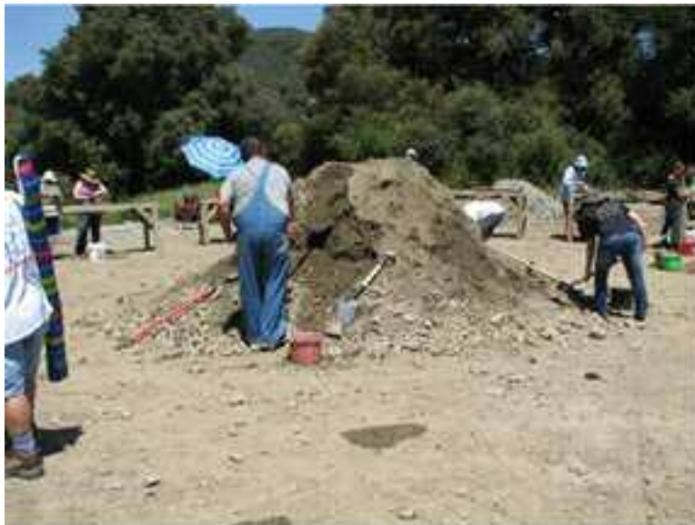
Digging for gemstones at the Himalaya Mine, April 28, 2012