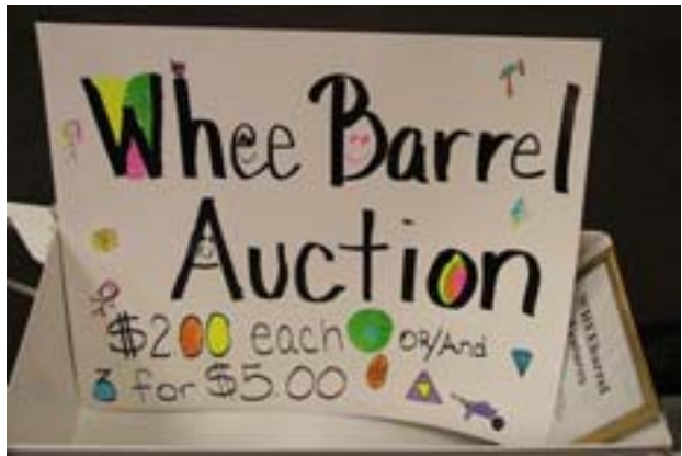
Donated by Diamond Pacific