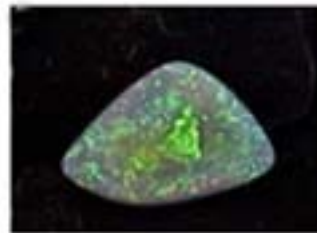
Lightning Ridge Crystal Opal