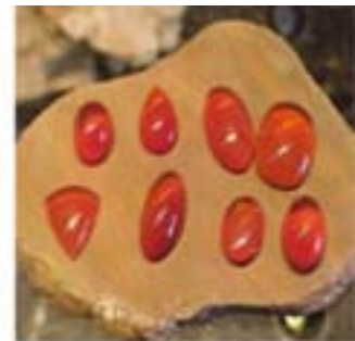
Mexican Fire Opal