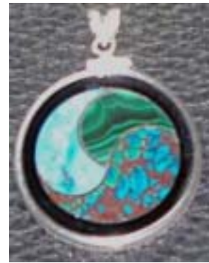
Turquoise, Malachite, Crysocolla, Cuprite, Black Onyx, Sterling Silver