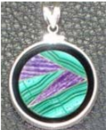
Malachite, Sugilite, Black Onyx, Sterling Silver