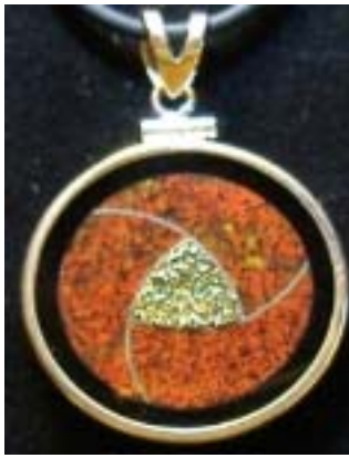
Dinosaur Bone, Druzy Pyrite, Black Onyx, Sterling Silver

If you live in the greater Los Angeles and orange county areas, He is available by appointment.