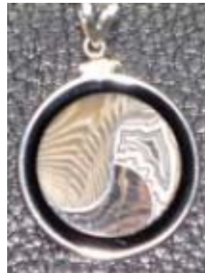
Petrified Palm, Agate, onyx, Sterling Silver