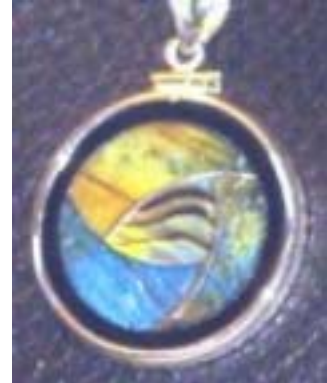
Labradorite, Abalone, Black Onyx, Sterling Silver