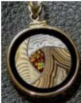
Petrified Palm, Agate, Onyx, Fire Aget, Black Onyx. Y/G