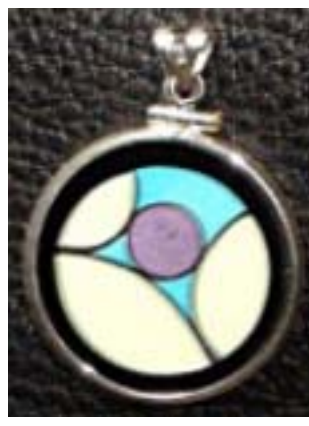
Magnesite, Turquoise, Sugilite, Black Onyx, Sterling Silver