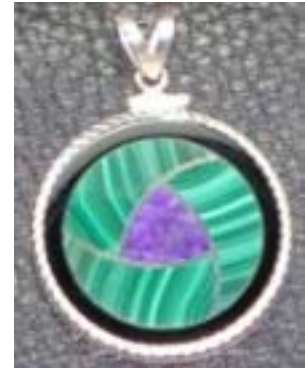
Malachite, Sugilite, Black Onyx, Sterling Silver