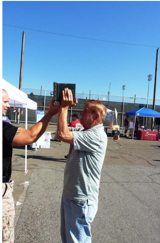
Lifting a Marine Ammunition Box at the La Habra High School Band Buster Car Show

Saturday, January 24, 2015 (9:00 a.m' MST) Senior Citizen's Center Moon Mountain Road Quartzsite, Arizona