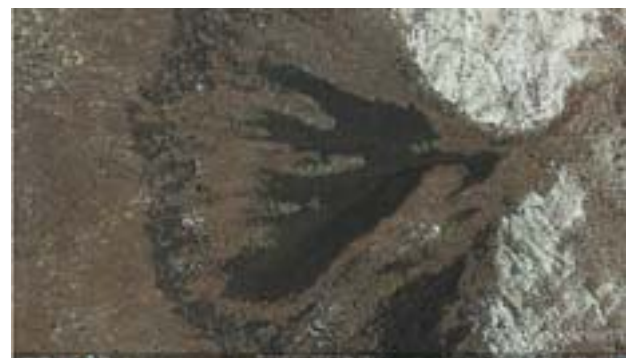
Thunderbird from Space