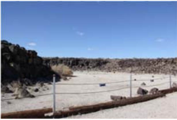
Petroglyphs In Inscription Canyon