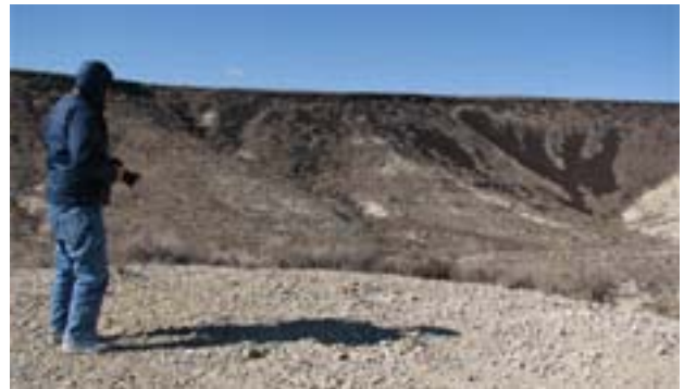
Checking Out Inverted Thunderbird