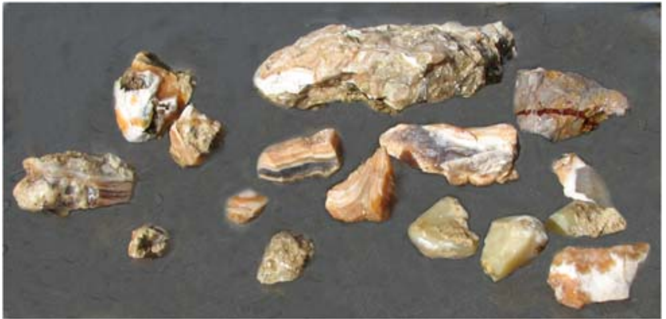
Orange & Some Amber Opals