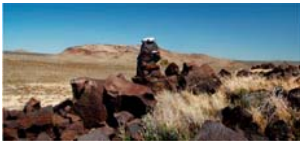
Ancient Native American Rock Cairn A cairn is a man-made pile or stack of rocks for landmarks or religious reasons