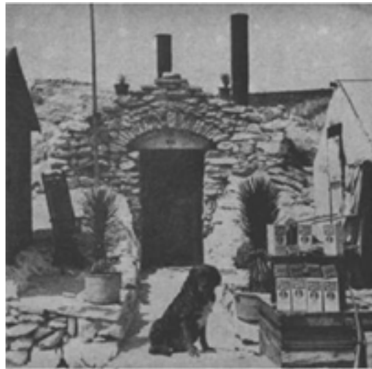
American Opal Co. Dugout - 1915