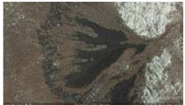
Thunderbird from Space