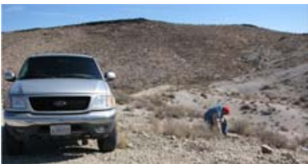
Seeking The Not-So-Illusive Amber-Opal