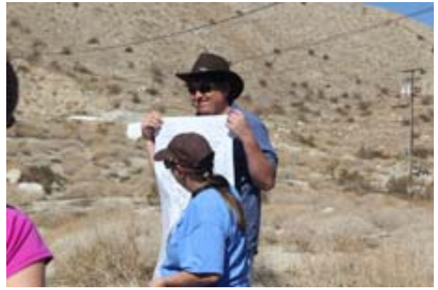
Whitewater Cutoff - Quarry Located north of Banning Strand of the San Andreas Fault