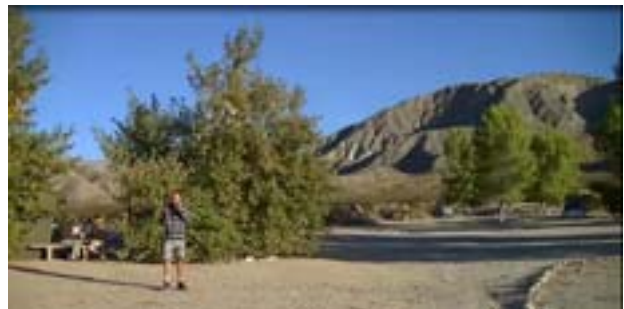
Mission Creek fault in background