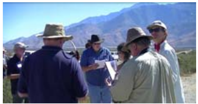
Morongo Band o Mission Indians Land