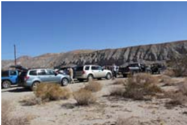
Coachella Valley Banning Fault