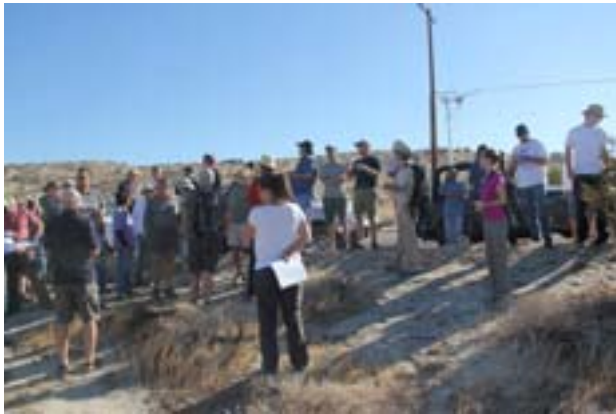
Standing on the Mission Creek scarp underlying Mountain View Road in Desert Hot Springs, CA