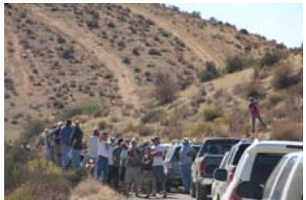
Millard Canyon - Thrust of Banning Fault