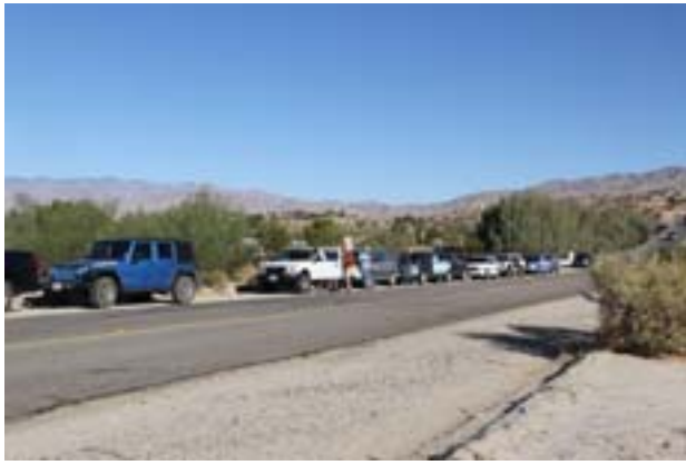
Mission Creek Fault