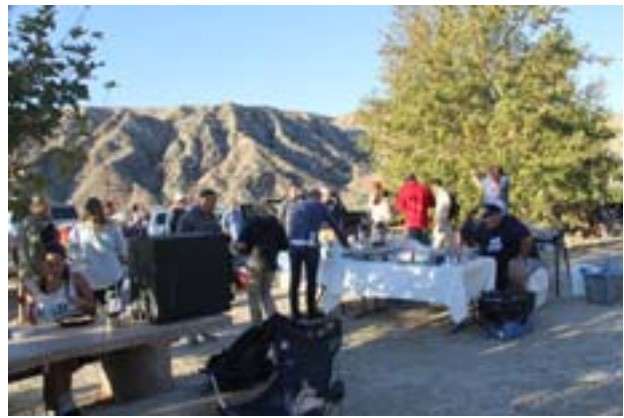
Saturday breakfast at 7 a.m.