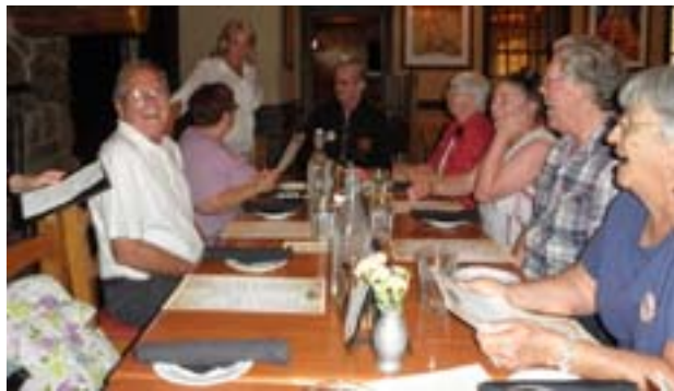
Too mush fun!