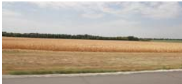
Acres after acres have died. I see the price of cornflakes going up next year.