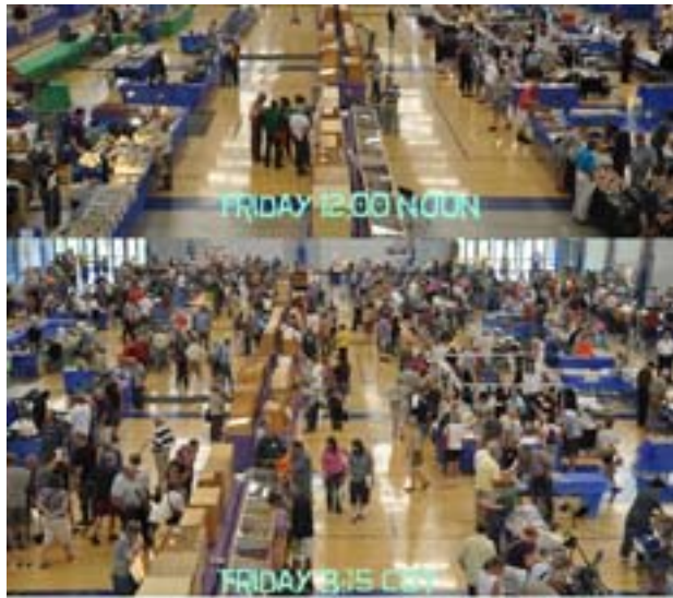
AFMS 2012 Show Timeline