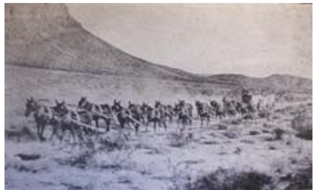
Wagon loads of Silver ingots to Los Angeles