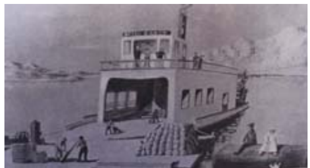
The Bessie Brady, a boat, that replaced the wagons.