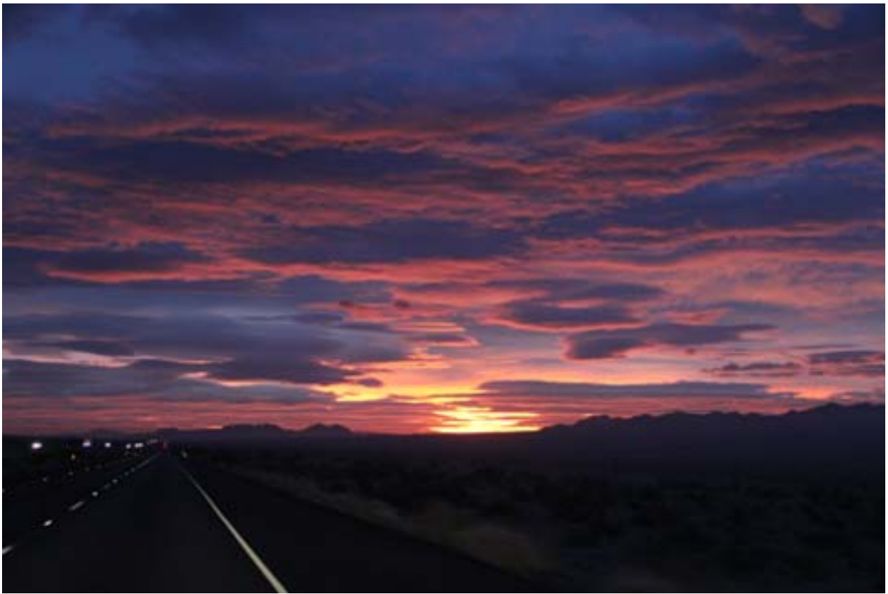
On the way to Quartzsite, January 21, 2012