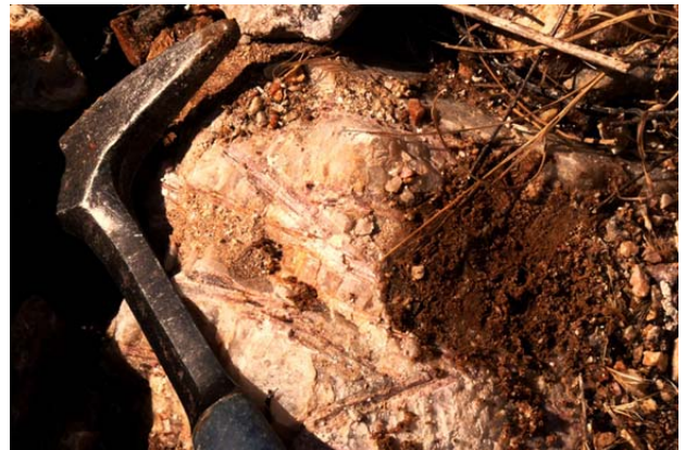
Tourmaline in Tailings