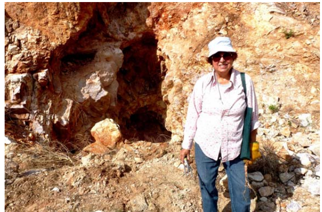
1800 rds Entrance