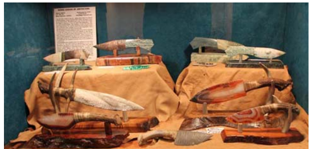
Knives Made Out of Rocks