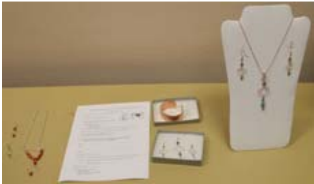
Samples of Jewelry to be made this year in the Jewellery Class