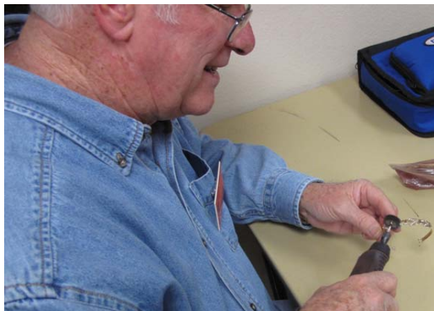
The finishing touch!