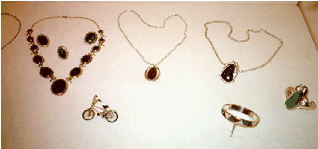
Al's Case at the Diamond Daze Show in Riverside - August, 1996