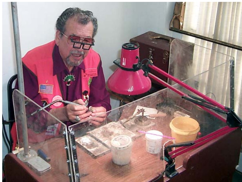
Demonstrator at NOC Show - March 25, 2000