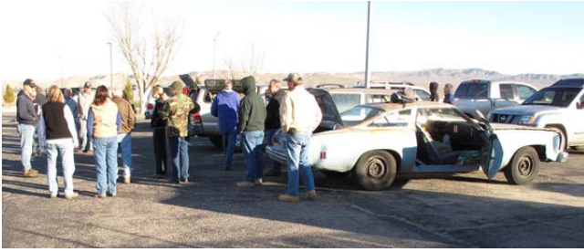
Diamont Pacific Parking Lot -- Do You recognize the car with the open door?