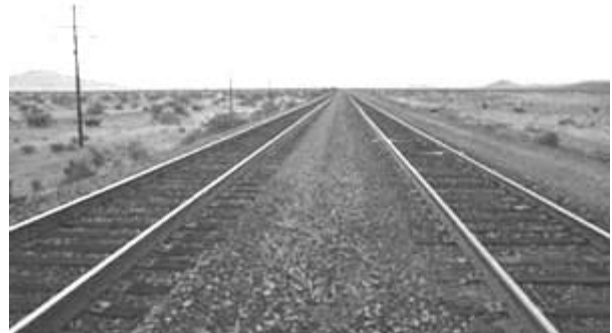
On the way to the Fluorite Mine area.