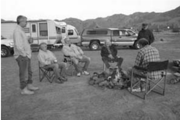
Early Morning Campfire