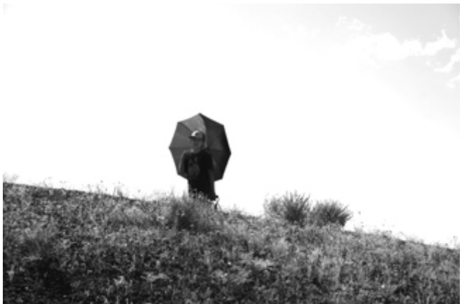
Rockhound with an Umbrella